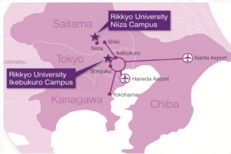
Tokyo and Vicinity

Location: Ikebukuro (Tokyo) & Niiza (Saitama)