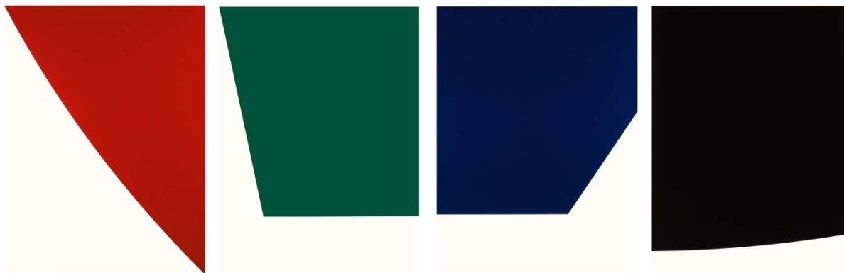
Ellsworth Kelly, Mallarmé Suite , 1992 , 4 lithographies sur papier BFK, EA V (éd. 40), 73,7 x 54,6, INHA