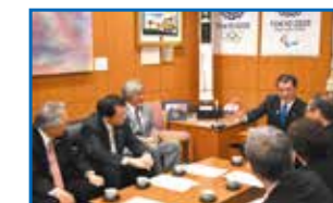
Opinion Exchange Meeting with Mr. SHIBAYAMA, Masahiko, MEXT Minister

Ordinary General Assembly meetings (Jun., Nov., Jan., Mar.) Board of Directors meetings (Apr., May, Jul., Oct., Dec., Feb.)