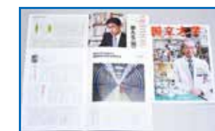
Public relations magazine "National Universities" published

Public relations magazine "National Universities" published (Jun. Sep., Dec., Mar.) Extra issue of the public relations magazine "National Universities" published (Jul.) Discussion meeting with editorial writers held (Oct.)