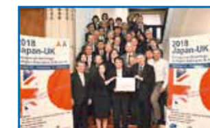
2018 Japan-UK Dialogue on Exchange in Higher Education & Research

Released "Reference Examples in the Utilization of the English Certification Exam and Description Type Questions (Japanese language) in the Nationwide University Entrance Examinations Framework". (Jun.) Released "Encouraging Future Joint Research through Full-fledged Collaborations between Industry, Academia, and Government" (Interim Summary). (Jun.) Released "Organization and Governance that Accelerates the Strengthening of National University Functions and the Nature of Legal and Systemic Revisions that Contribute to That (Summary of Issues)". (Jun.) Submitted "Requests Regarding and Securing a Sufficient National University-related Budget and Tax Revisions for Fiscal Year 2019". (Aug., Sep.) Released "Measures for Investing the Management Expenses Grants According to the Purpose of the National University Corporation System! (Statement)". (Nov.) Released "Basic Concepts Underpinning Human Resource and Wage Management Reform to Promote Revitalization of National University Education and Research". (Nov.) Released "The President's Comments on the National University-related Budget and Tax Revisions for Fiscal Year 2019". (Jan.) Released "Policy Regarding the Handling of Publication of Examination Questions and Sample Answers Concerning the Selection of National University Entrants". (Jan.)