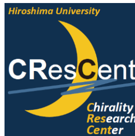
Chirality Research Center