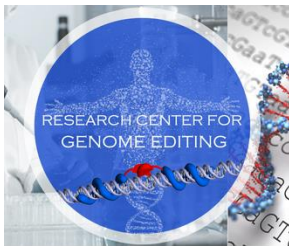
Research Center for Genome Editing