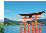
Itsukushima Shrine in Miyajima