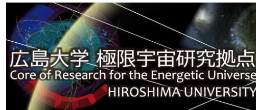
Core Research for Energetic Universe