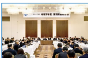
The second Board of Directors meeting (Asahikawa, Hokkaido)