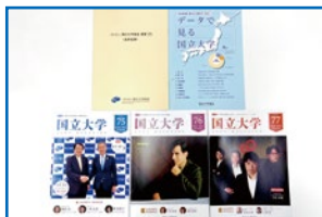
Publication of the National Universities magazine and other reports