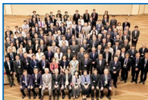
2025 Taiwan-Japan University Presidents' Forum