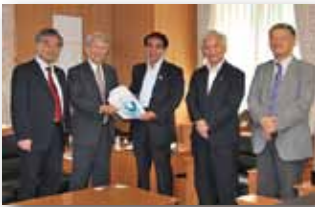
Meeting with Mr. Hakubun Shimomura, MEXT Minister