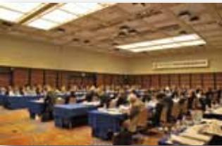
The second regular general assembly meeting held in Wakayama City

Public relations magazine National Universities (former JANU ) published (June, October, December and March)