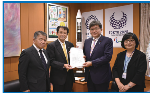
Written request submitted to Mr. HAGIUDA Koichi, MEXT Minister

Ordinary General Assembly meetings (Jun., Nov., Jan., Mar.) Board of Directors meetings (Apr., May, Jul., Oct., Dec., Feb.)