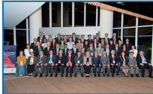
Japan-Australia University Dialogue2019