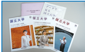
Publication of the National Universities magazine and other reports