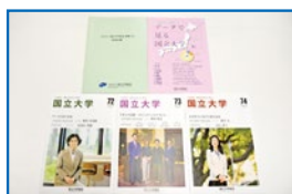
Publication of the National Universities magazine and other reports