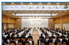
The second Board of Directors meeting (Akita)