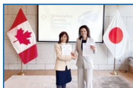
Signed an MOU on Exchange and Cooperation with Universities Canada (Nov.)